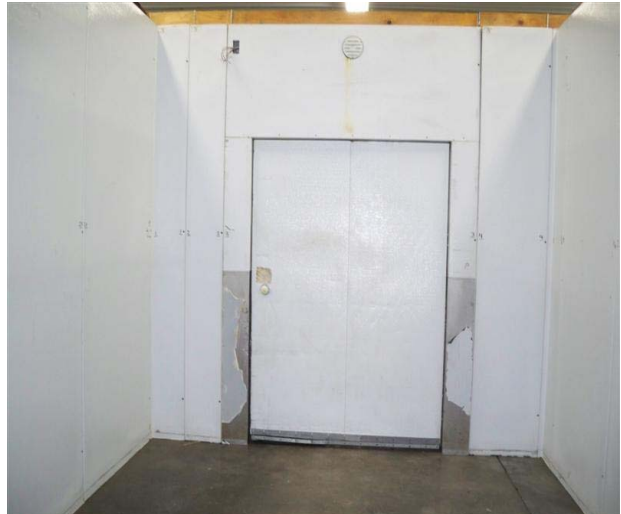
19'3" x 19'8" x 10' H Walk-In Combination Cooler/ Freezer